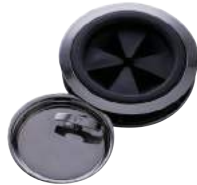
#7 Collar Adaptor with Splash Baffle and Stopper