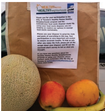
“Enjoy the Fruit, Grind the Rind!” Participants were reminded of the challenging food waste their advanced disposer could grind with a complementary bag of fruit.

The program was named, “Healthy Homes, Healthy Neighborhoods” in resident communications. Following several canvases, 90 households in the Wapato Lake area agreed to have a new food waste disposer installed. Disposers were installed in May/June, 2013 in 63 of those homes (the remainder were eliminated or dropped out). Over the following year, those households received various outreach efforts designed to guide their use of the disposer – including mailings, door-to-door visits and phone calls.